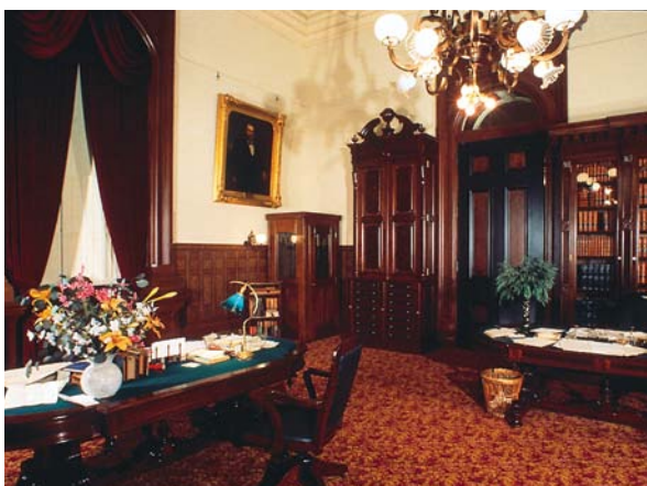
Historic Governor's Main Office—1906