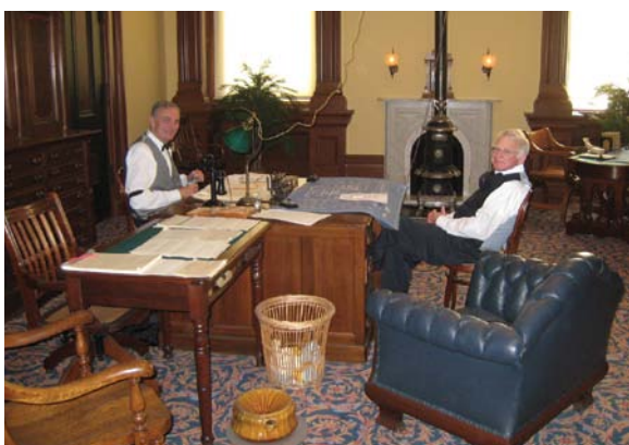
Living History Day

The State Capitol Museum presents free living history events. Election Day, 1906 Earthquake, Governor's Day and California Admission Day Living History Programs transport visitors back to the early days of California government. Costumed volunteers participate in these events.