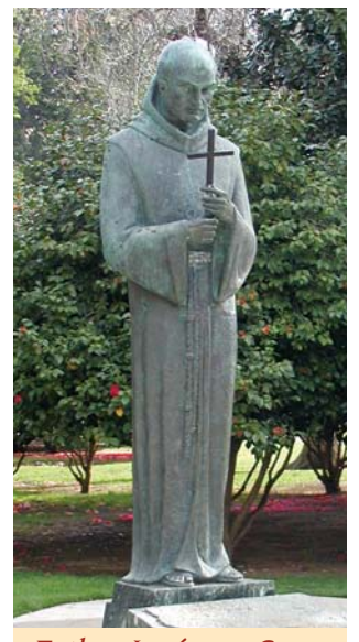
Father Junípero Serra