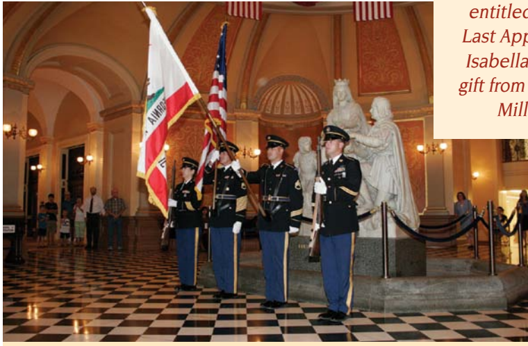
First floor Rotunda

In the heart of Sacramento on 10th Street between L and N Streets, California's State Capitol embodies the best of California's past and present. Forty acres of lawns, flower gardens and memorials to California history surround the building. Stately trees in Capitol Park, including many exotic species planted over 100 years ago, thrive in Sacramento's climate.