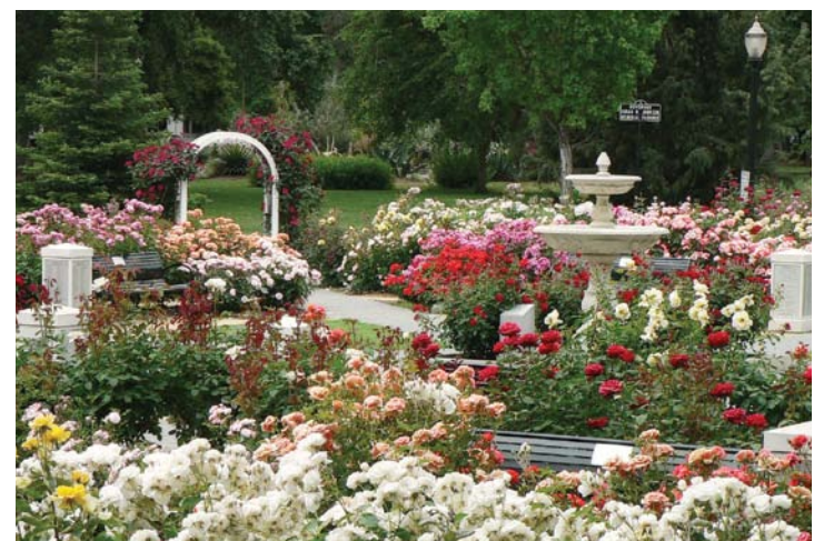
World Peace Rose Garden

Between 1849 and 1854, four cities served as state capitals—San Jose, Vallejo, Benicia and finally, Sacramento. Construction on the new Capitol began in 1860 and concluded in 1874.