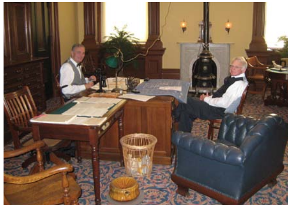
Living History Day

The State Capitol Museum presents free living history events. Election Day, 1906 Earthquake, Governor's Day and California Admission Day Living History Programs transport visitors back to the early days of California government. Costumed volunteers participate in these events.