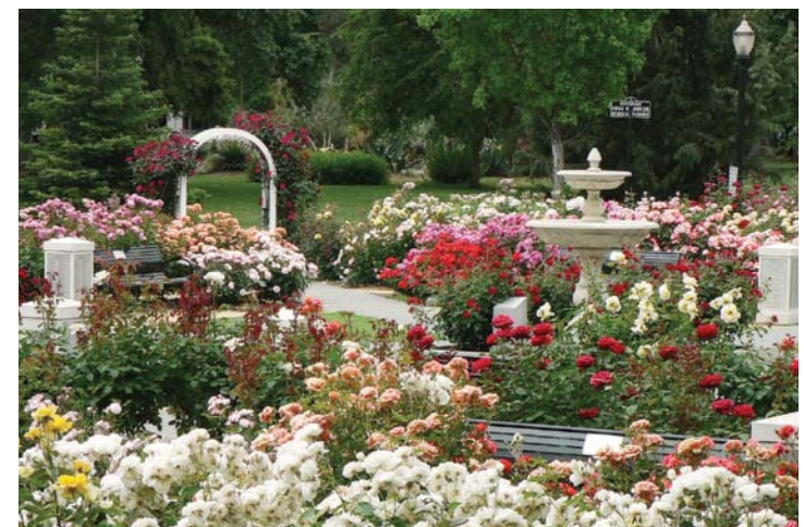
World Peace Rose Garden